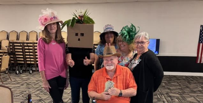
Kentucky Derby Night. The Girls and their Hats! Watching the race and betting on our own horses. Enjoying the night, so much fun.