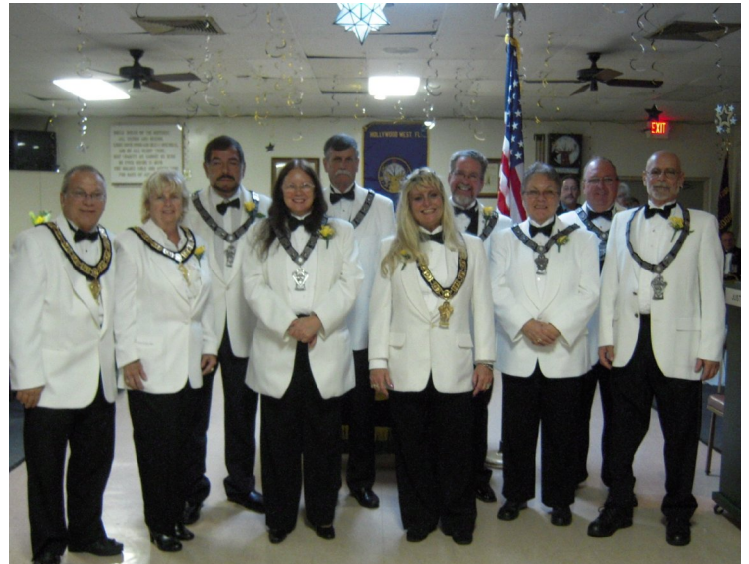
After installation on April 1, 2012. Officers for Fraternal Year 2012 – 2013

Accounting Services (954) 434-6507 Tax Preparation Fax: (954) 434-6633 Investment Planning