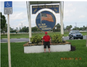
October 2011 Lodge Crawl