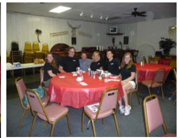
Re-Creation at Hollywood West for Dinner, February 16th.