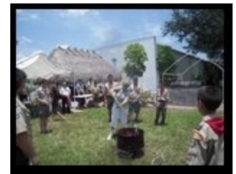
Flag Day 2011.