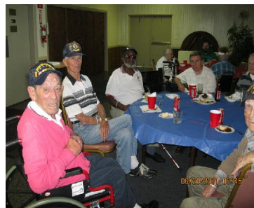
Vets enjoying a meatloaf dinner and music.