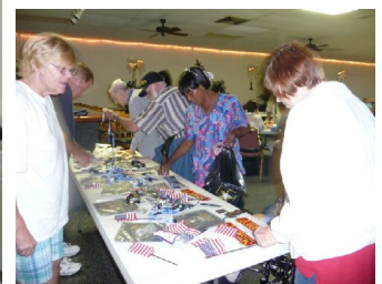
At the goodie table..