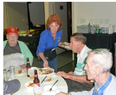
Ahhh! A Home cooked Meal!