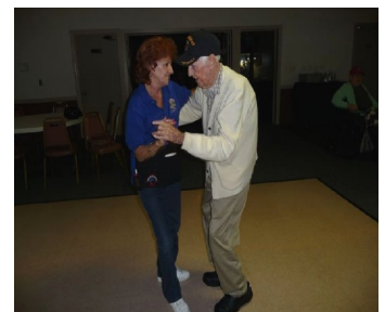
Cuttin' a rug!!