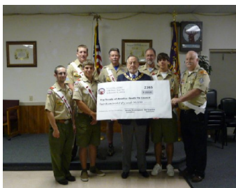
ER Jesse presenting a check to the Order of the Arrow/Eagle Scouts.