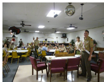
Order of the Arrow Eagle Scouts meeting at the Lodge.