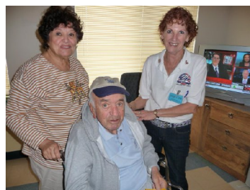
A new hat.