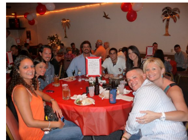
Enjoying the Celebration of Life.