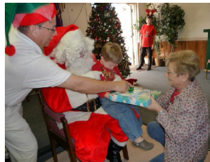
Receiving Gift from Santa.

Christmas visit at the VA Hospital Facility.