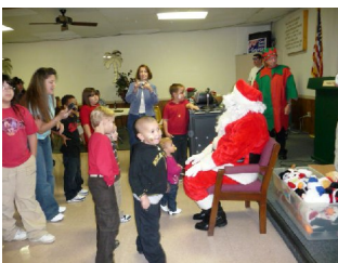
Waiting to talk to Santa.