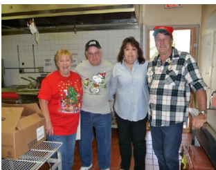
The Parsons Crew. Yeah!

When there are 6 or more people present, the bartender has the discretion to extend the hours, except on Friday nights where the 2 AM last call will be.