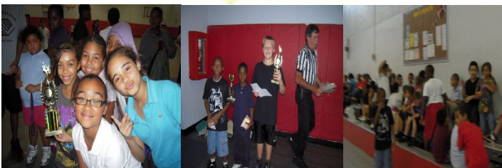
Hoop Shoot Activities