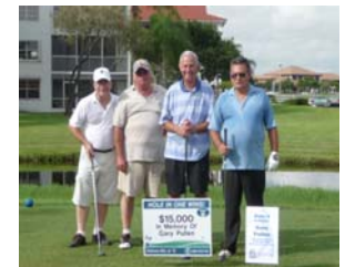
Getting ready for the tee-off!