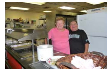
Serving dinner after the round.