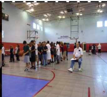
Hoop Shoot 2009