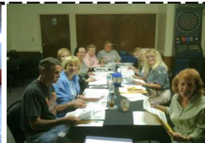
Thanks to the volunteers, who helped grade 26 scholarship applications.